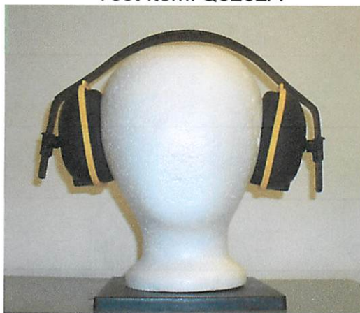
Test Item: Q3262A

These data were obtained through measurements made at the laboratories of Michael & Associates, Inc., State College, PA, USA. Michael & Associates, Inc., is accredited to test to ANSI S3.19-1974, ANSI S12.6-2008, ANSI S12.42-2010, EN352 parts 1-8 and AS/NZ S1270:2002 by the National Institute of Standards and Technology (NIST) National Voluntary Laboratory Accreditation Program (NVLAP).